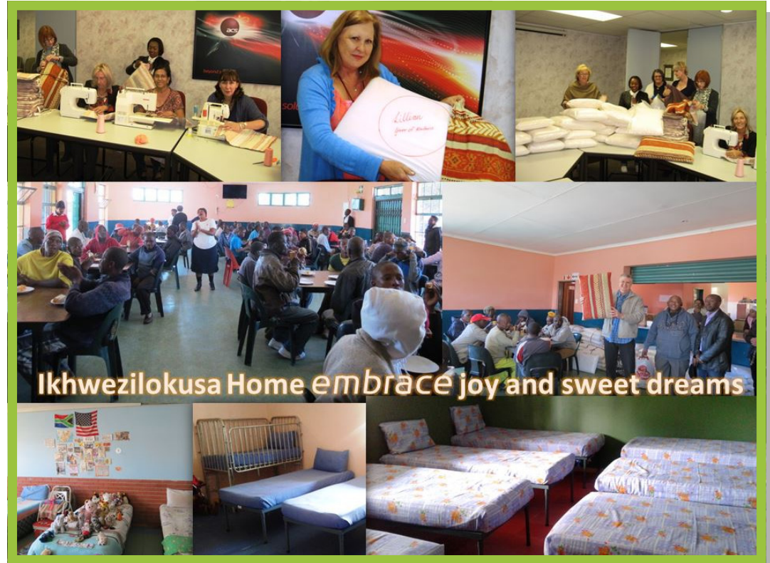
Ikhwezilokusa Home embrace joy and sweet dreams

The Embrace outreach team has been busy sewing pillow cases and personalising pillows for all at the Ikhwezilokusa Home. One of the meeting rooms at ACS House was transformed into a sewing centre as team members' setup sewing and overlock machines. The fabric was laid out, measured and cut to size, needles were threaded and the huge task of making 200 pillow cases began.